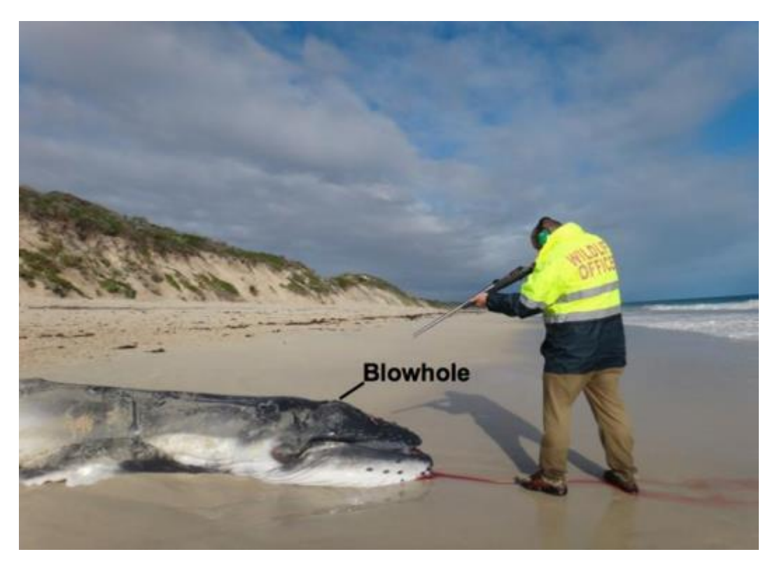
Figure 5. Lateral view, demonstrating the recommended shot distance.