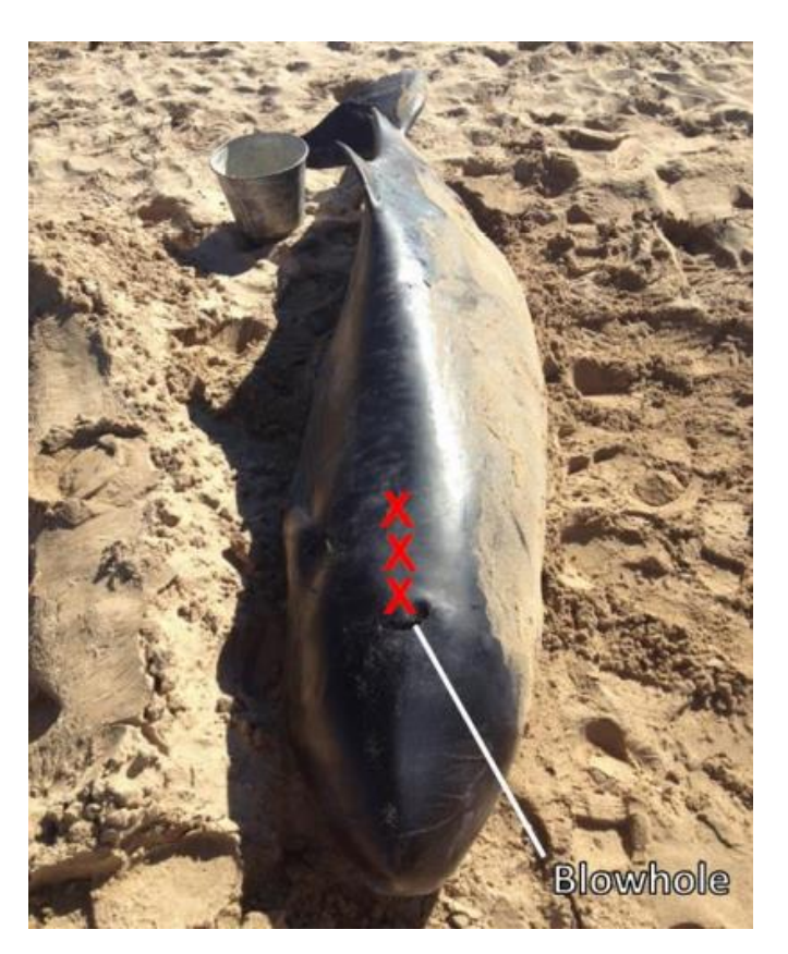
Figure 3. Dorsal view, indicating the recommended aim points for three successive shots, relative to the blow hole.