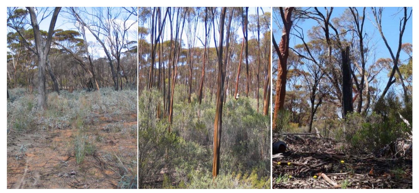
Left: A recently burnt (2 years post-fire) gimlet woodland, with regenerating Eucalyptus salubris , and the post-fire ephemeral Glischrocaryon spp. in the foreground. Centre: Gimlet woodland of an intermediate (~40 years) time since fire, showing high cover of 'pole' E. salubris and a dense shrub layer. Right: Mature gimlet woodland (> 200/450 years post-fire), showing lower tree and shrub cover, but more space at ground level for low shrubs, perennial herbs & grasses and annuals.