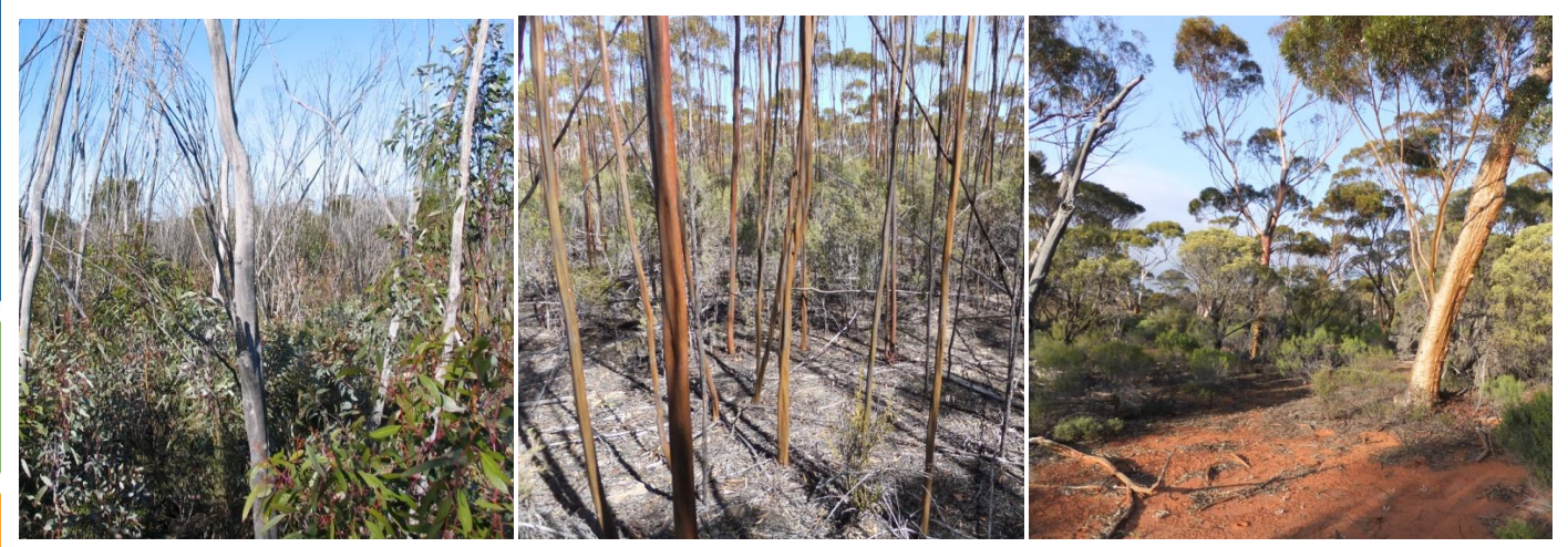
Eucalyptus salubris woodland representative of 'young' (left; <20 years since fire), 'intermediate' (35 to 120-200 years since fire) and 'mature' (>140-260 years since fire) age classes. The ranges in the bounds of age classes reflect differences between models used to estimate stand time since fire (see Information Sheet 65).

• Lateral gaps between foliage increased with time since fire (Fig. 2), indicating that in mature woodlands longer flame lengths would be required to bridge gaps between foliage fuel.