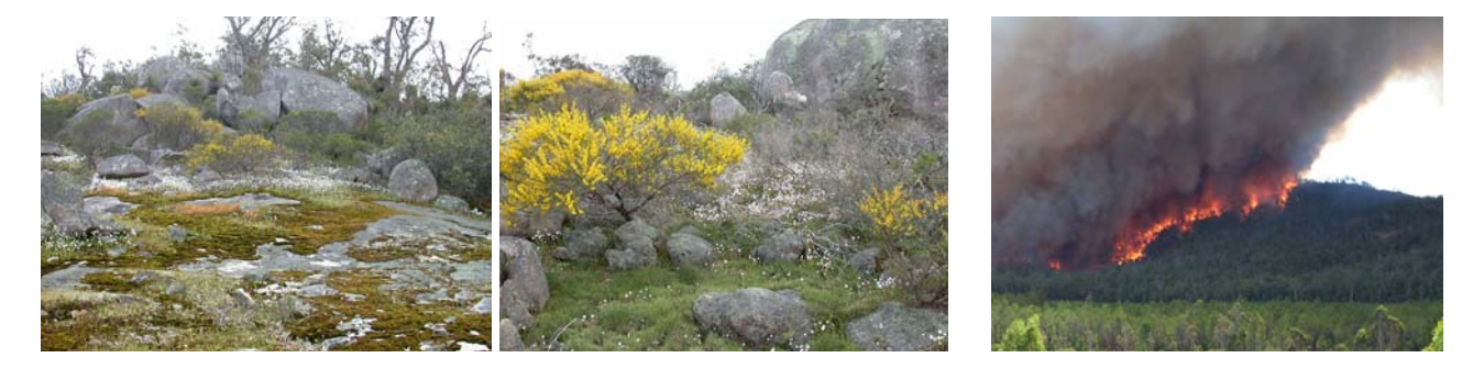
Mt Cooke monadnock before the 2003 wildfire. A 'refuge' for fire sensitive and fire intolerant species and communities such as Acacia ephedroides (yellow flowers), moss swards (foreground left photo) and Borya meadows (foreground right photo).

Granite rock outcrops are the remains of an ancient land surface that was thought to have been stripped away some time between the Middle Jurassic and the early Eocene, some 60 million to 150 million years ago. These outcrops are of immense biological importance because they are often 'islands' that comprise a small proportion of the entire landscape, so are uncommon and unusual compared with other landforms. Consequently biotic assemblages on rock outcrops are also uncommon and unusual landscape elements. Rock outcrops in the south-west forest region display high levels of plant endemism and species assemblages that contrast with the surrounding landscape as a result of strong environmental gradients, particularly associated with substrate and moisture regime. A significant proportion (~11 per cent) of all Declared Rare Flora in the south-west region occurs on or around rock outcrops.