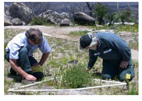
Forest and woodland trees on and around rock outcrops take many decades to recover following an intense wildfire.