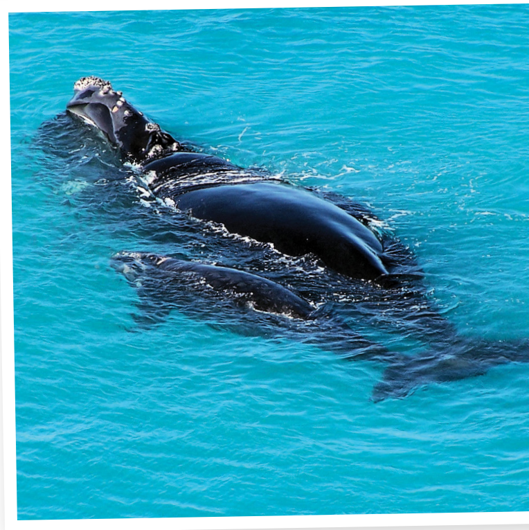
Top Marine parks provide for biodiversity conservation.

Some human activities can pollute, degrade and deplete the marine environment and put the survival of marine plants and animals at risk. Degradation of the marine environment can happen incrementally over long periods of time as populations and coastal water usage grows; or more suddenly such as when oil or other substances are accidentally released into the water. Marine parks provide tenure, long-term funding and a range of management tools to help to conserve marine ecosystems so that we can continue to appreciate and enjoy these areas into the future.