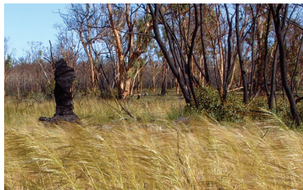
Top Macarthuria australis .