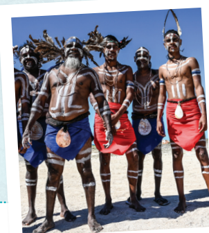
Above left Bardi Jawi Gaarra Marine Park.

Supernatural sea creatures such as the loolooloo [shark] have always existed to protect Bardi and Jawi people in their sea faring life. Bardi and Jawi people have always engaged in, and continue to engage in, shore fishing, collecting sea food from the intertidal zone, hunting odor [dugong] and goorlil [turtle] in the shallows and from rafts with the goorlil [turtle] and odor [dugong] being shared in accordance with traditional lore. Pearl shell is also collected and used as a resource for ceremony and trade."