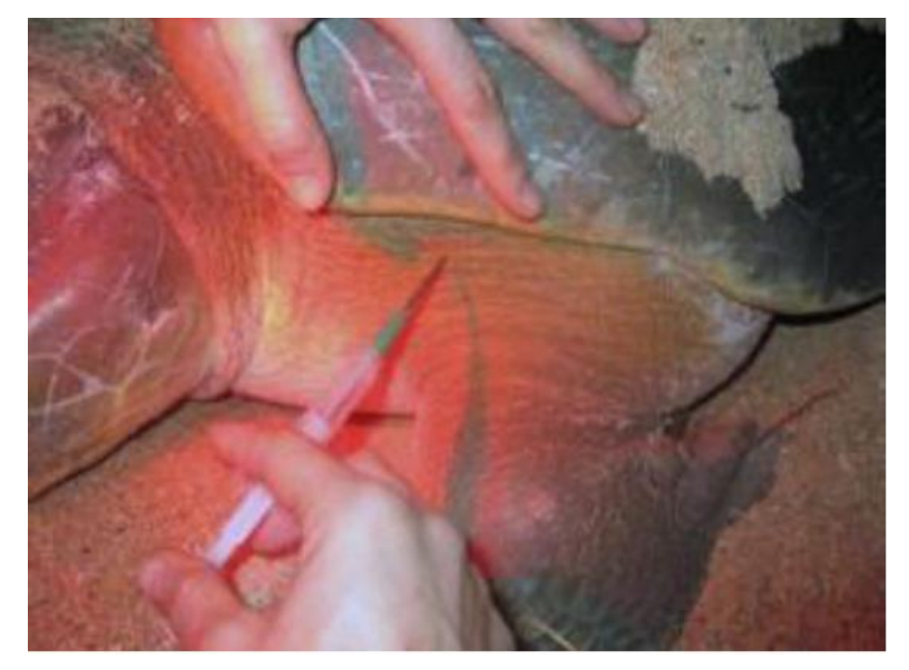
Figure 4 Inserting the PIT tag. Steady yourself and insert the needle in a smooth and confident motion, angling it away from the head. Do not move the needle inside the body. Remove it immediately after depressing the plunger maintaining the same angle at all times.

ANIMAL WELFARE : The needle should be inserted and withdrawn at a horizontal angle away