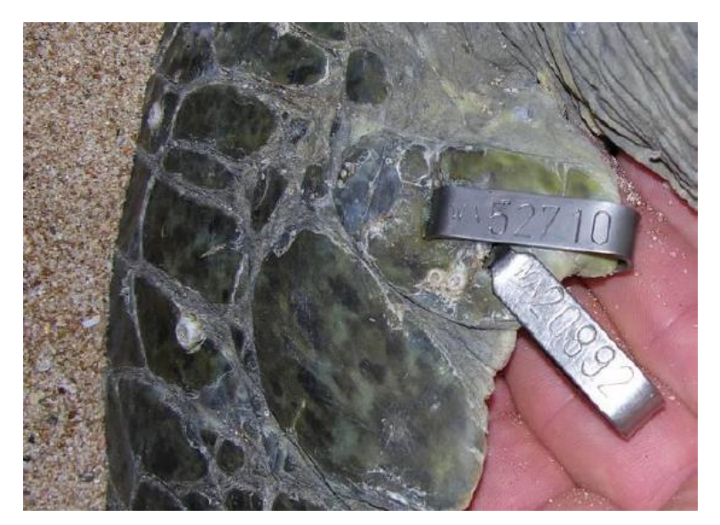
Figure 5 Green turtle flipper showing a new tag inserted in the centre scale, because the old tag is growing out with the scale.