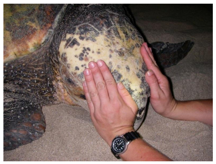
Figure 2 An example of restraining a loggerhead turtle. Note that the turtle is being restrained from the front, the nostrils are clear, and the handler's fingers are pointing up and away from the turtle's mouth.

If restraint is necessary, do so as instructed by the team leader since the method can vary depending on the circumstances. Restrain the turtle by covering its eyes, making sure that its nostrils are exposed, so that it can breathe, and so as to minimise discomfort. Restrain by facing the turtle, pushing the head back into the carapace and downward, applying only enough pressure to stop the forward movement of the turtle. Fingers must be kept pointing upward, away from the turtle's mouth (see Figure 2), as they can be bitten (or even severed) by the turtle.