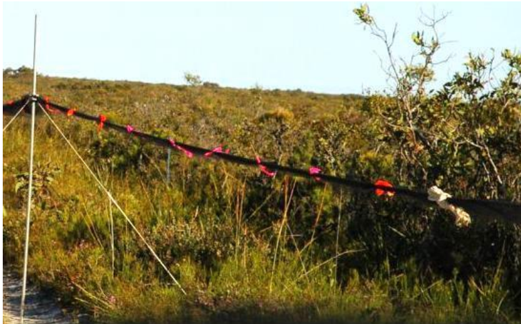
Figure 2 A furlled mist net.

Mist nets are usually stored in cloth bags with the string loops of each end bunched and tied together and one bunch at the bag's opening. When nets are not in use they are removed or furlled (by rolling and tying off with flagging tape at one metre intervals) so that they will not continue to entangle birds or other animals, or unfurl in the wind (see Figure 2). Training in correct, tight furling techniques by an ABBBS licence holder is recommended. Even small sections of loosely-furled net can entangle flying birds or birds that perch on a furlled net. All loose sections must be attended to. Even furlled nets should be checked at regular intervals, especially if it has been windy.