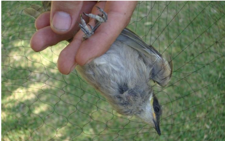
Figure 3 A singing honeyeater being removed from a mist net. Note the feet being extracted first with netting only remaining around the carpal joint.