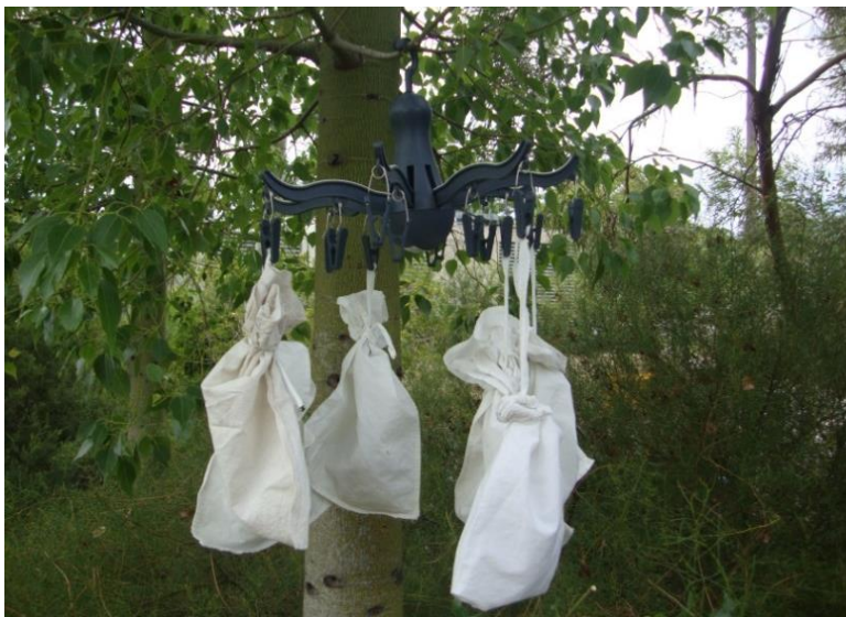
Figure 5 A 'clothesline' set-up.