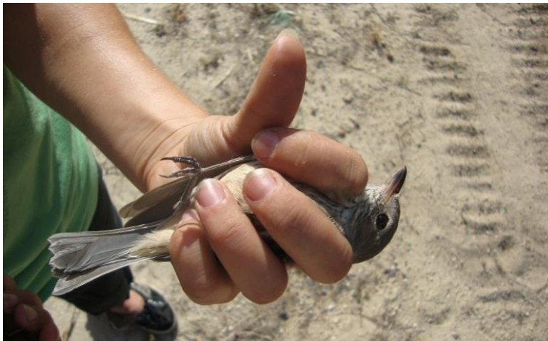
Figure 4 A rufous whistler in the 'banders grip'.