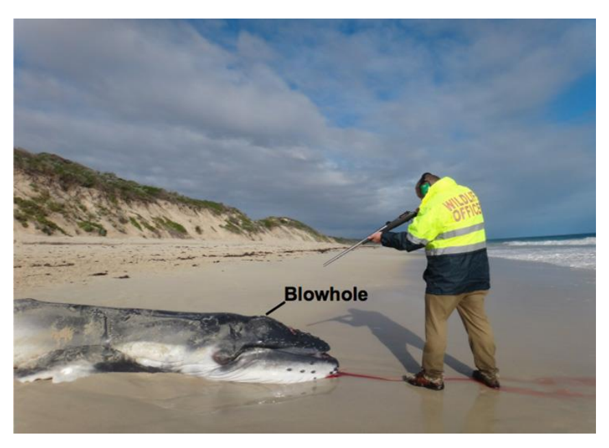
Figure 3 Lateral view, demonstrating the recommended shot distance.