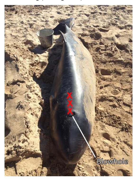
Figure 1 Dorsal view, indicating the recommended aim points for three successive shots, relative to the blow hole.

Shooting should always be directed to the dorsal surface of the animal, aiming slightly posterior to the blowhole and angled backwards at 45° (see Figures 1, 2 and 3) along the midline of the animal. This aim point corresponds to the vital centres of the animals' hindbrain, which lie midway between the eye and pectoral fin when the animal is viewed laterally (see Figure 2). The shooter should be standing 0.5-1m in front of the animals' head such that the muzzle of the rifle barrel is also 0.5-1m from the animals' blowhole at the time of shooting (see Figure 3).