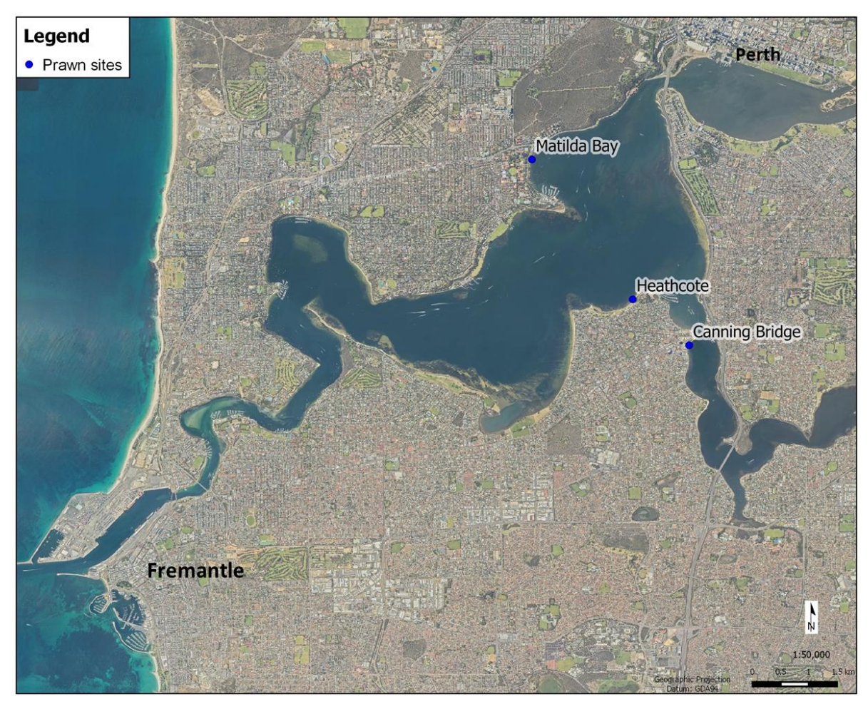
Figure 1. Map showing prawn collection sites in the Swan Canning Estuary