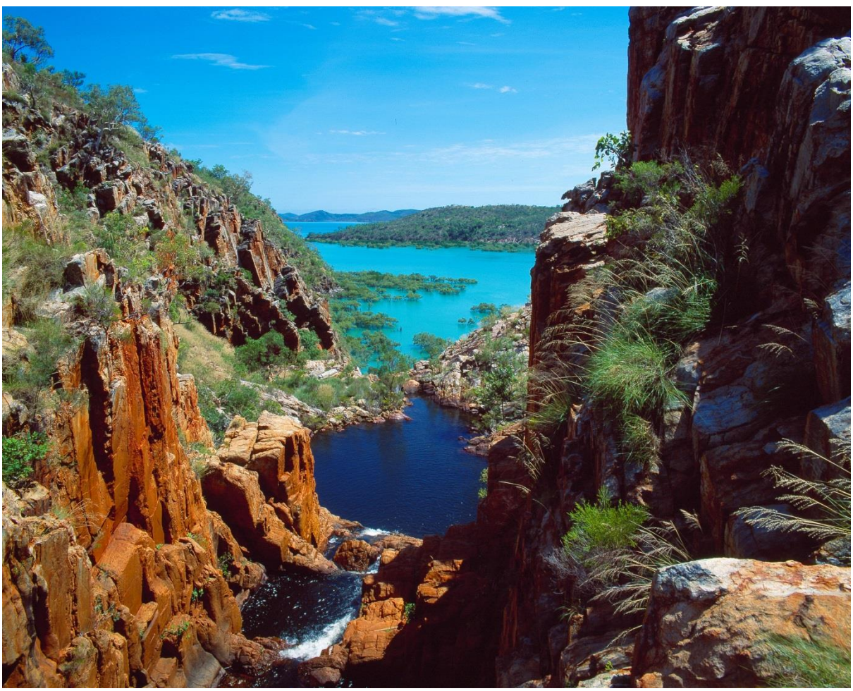
Waterfall, West Talbot Bay

Summary and analysis of public submissions to the draft joint management plan for the proposed Lalang-garram / Horizontal Falls and North Lalang-garram marine parks, and proposed Oomeday National Park