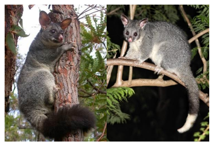
Common brushtail possum can have black or white tails, some less brushy than others.

Western ringtail possums are 30-40cm in body length and, weighing between 0.7-1.2kg, are generally about half the size of a brushtail possum. The body fur is a dark chocolate brown to dark grey with a white or grey belly. It is characterised by its short-furred and white-tipped tail which is as long as or longer than the rest of its body. Further information on the western ringtail possum is available on the species' webpage on the Department's website.