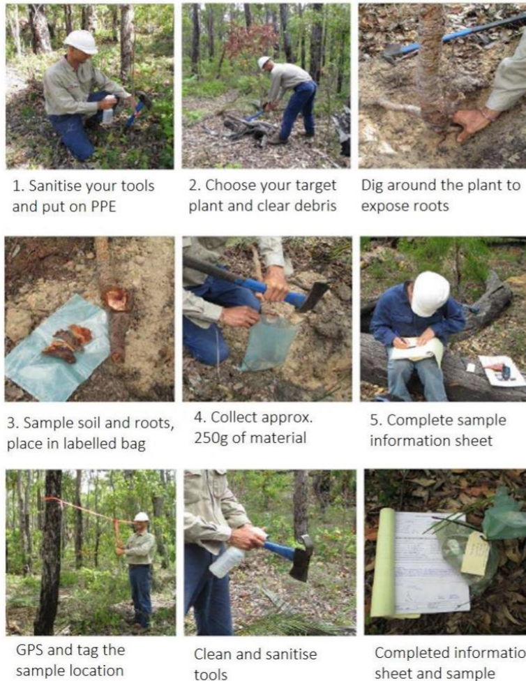
Figure 7. Steps for taking a root and soil sample for Phytophthora pathogens.