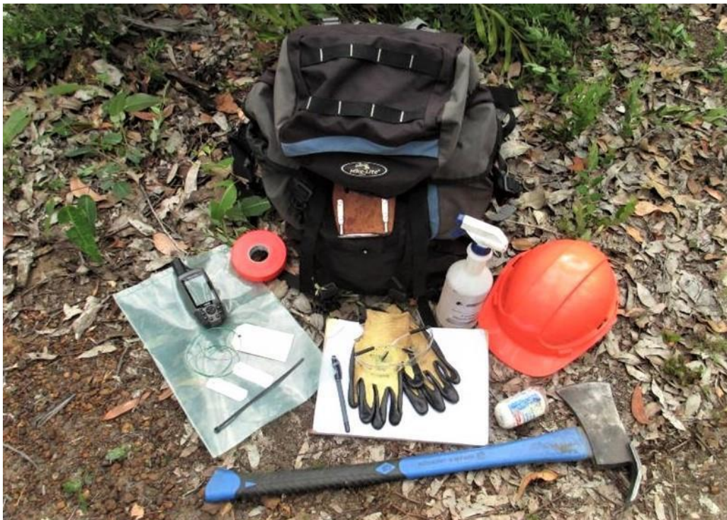
Figure 2 Example of sampling equipment.