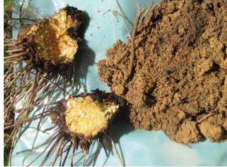
Figure 5. Dark lesion on infected roots of Xanthorrhoea species.