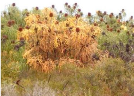
Figure 4. Example of a recently dead Banksia species.

You are sampling to recover a root pathogen so ensure you focus your sampling on roots rather than soil. Take all of the roots of small plants. For larger plants, aim to dig at least 30cm deep (enough to reach moist soil) and ensure material is taken on all sides of the plant. Target fine roots mixed with soil but also collect finger-width roots. For larger roots you can cut away sections of the cambium (live outer root layer) on each side of the root. Target roots darkened by lesions (dark rotten patches) on the cambium. If sampling in sandy exposed soil in the peak of summer, it may be necessary to go up to 60cm deep for a good sample.