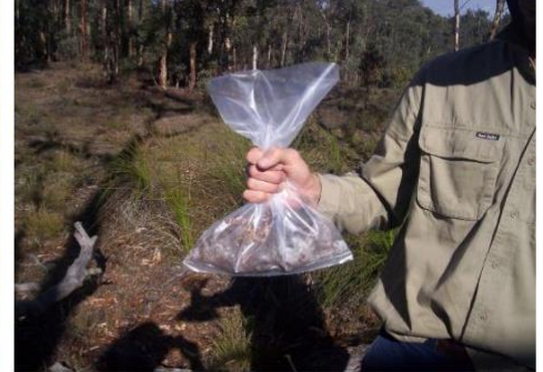
Figure 6. An ideal sample size.