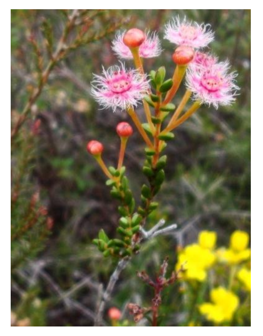
March 2012 Department of Environment and Conservation Warren Region