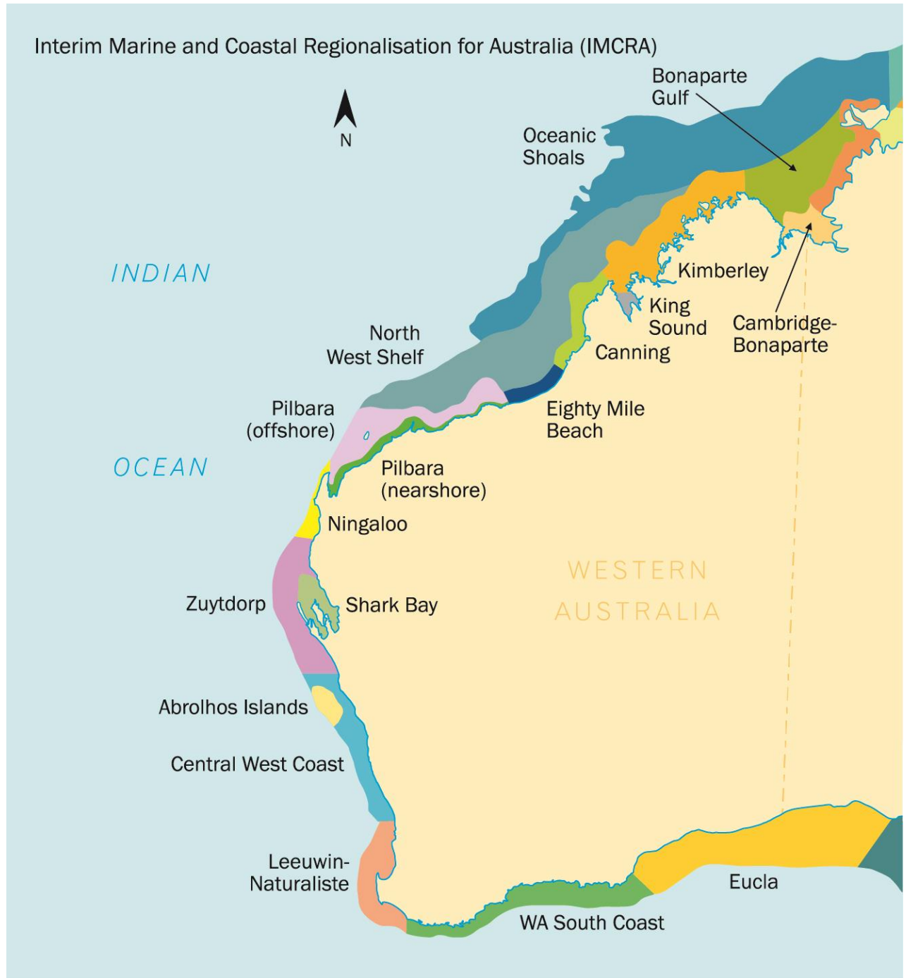
Map of Western Australia's IMCRA marine bioregions.