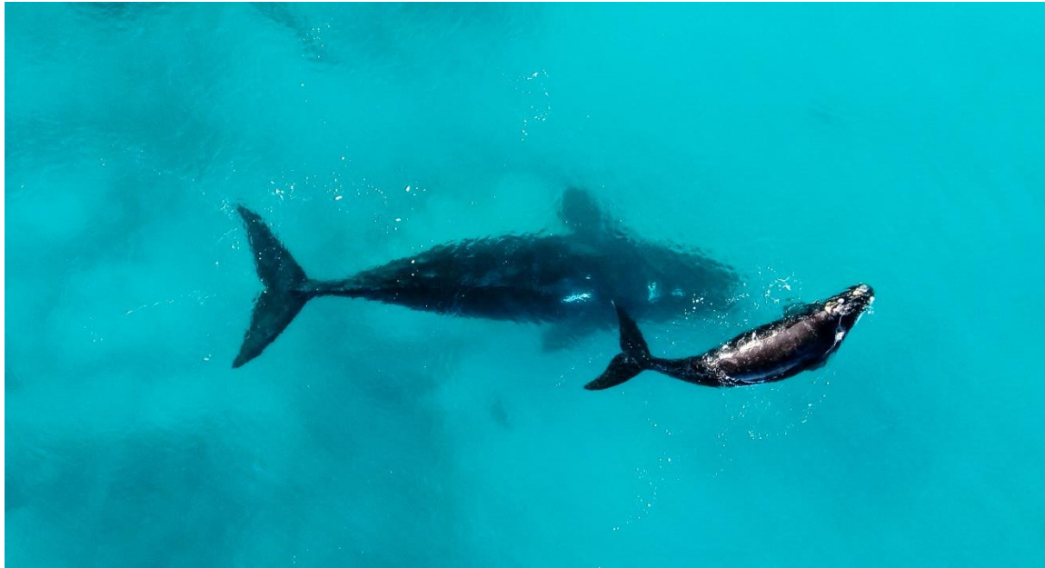
Migratory species such as southern right whales must be considered in the design of WA's marine park network.