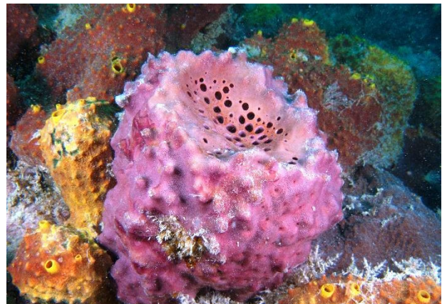
Sponges in the North Kimberley Marine Park.