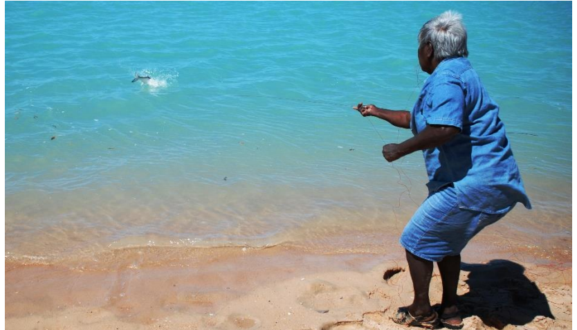
Fishing in the Yawuru Nagulagun Marine Park.

It is important to note that reliable and accurate socio-economic use information is critical to successfully avoid placing key resource use areas in highly protected zones. Attempts to circumvent or misdirect design processes by providing inaccurate information often leads to poor outcomes for those involved, when marine park planners are genuinely trying to avoid identified resource use areas and minimise impacts to existing