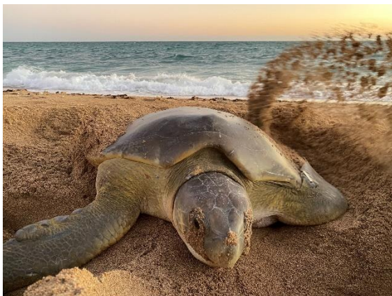
Flatback turtle nesting.