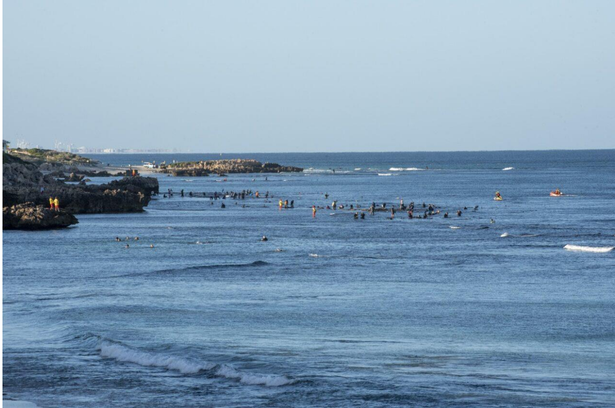
Recreational abalone fishing in Marmion Marine Park.