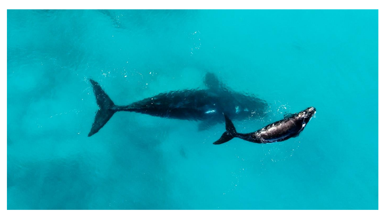
Migratory species such as southern right whales must be considered in the design of WA's marine park network.