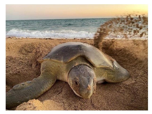
Flatback turtle nesting.