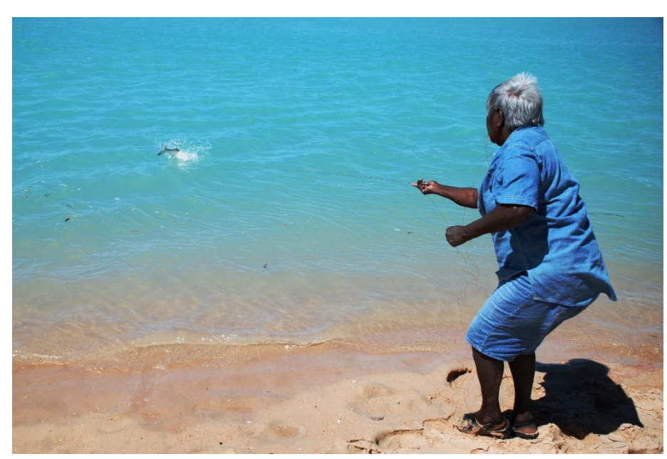
Fishing in the Yawuru Nagulagun Marine Park.

It is important to note that reliable and accurate socioeconomic use information is critical to successfully avoid placing key resource use areas in highly protected zones. Attempts to circumvent or misdirect design processes by providing inaccurate information often leads to poor outcomes for those involved, when marine park planners are genuinely trying to avoid identified resource use areas and minimise impacts to existing users. Trust is an essential component for all parties, and