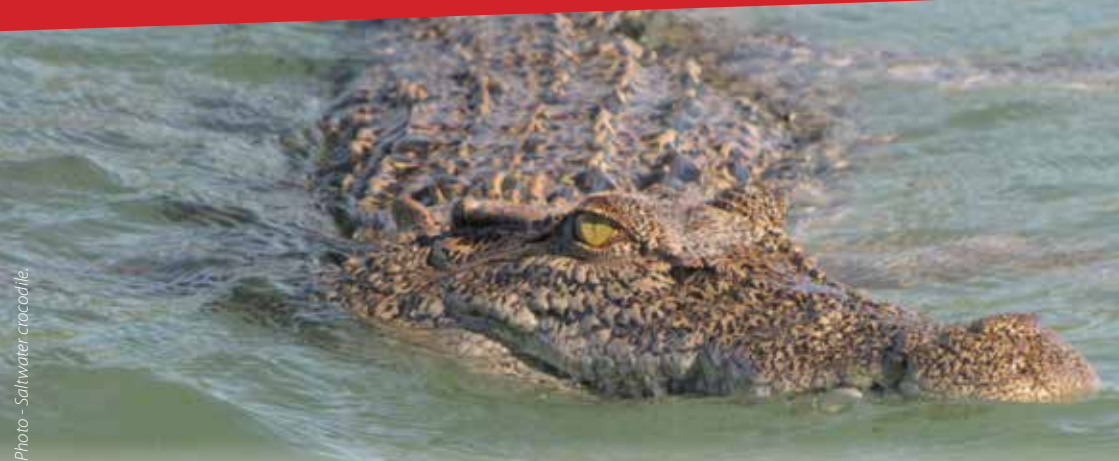
Photo - Saltwater crocodile.