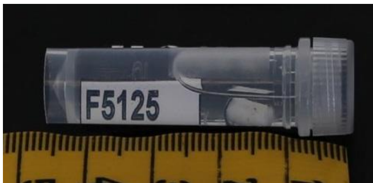
Figure 3 A 7 mm crocodile biopsy sample inside specimen vial. Vial contains 90% ethanol and identification label.

as F10SC) for 10 minutes, followed by a rinse with deionised water (See the department SOP for Tissue Sample Collection and Storage for Genetic Purposes for further detail and other sterilisation options).