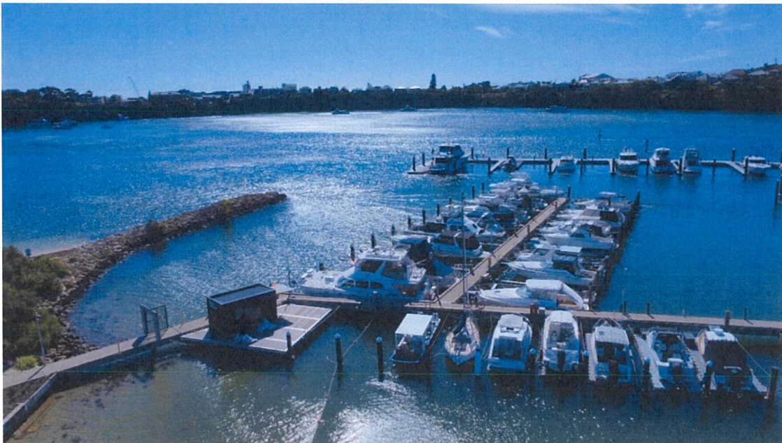
Figure 5: Location of the sauna with the backdrop of moored boats behind