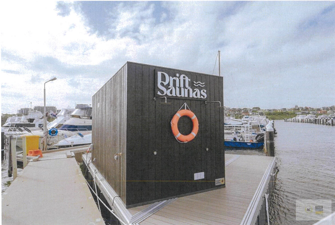
Figure 4: Shower facilities attached to the sauna