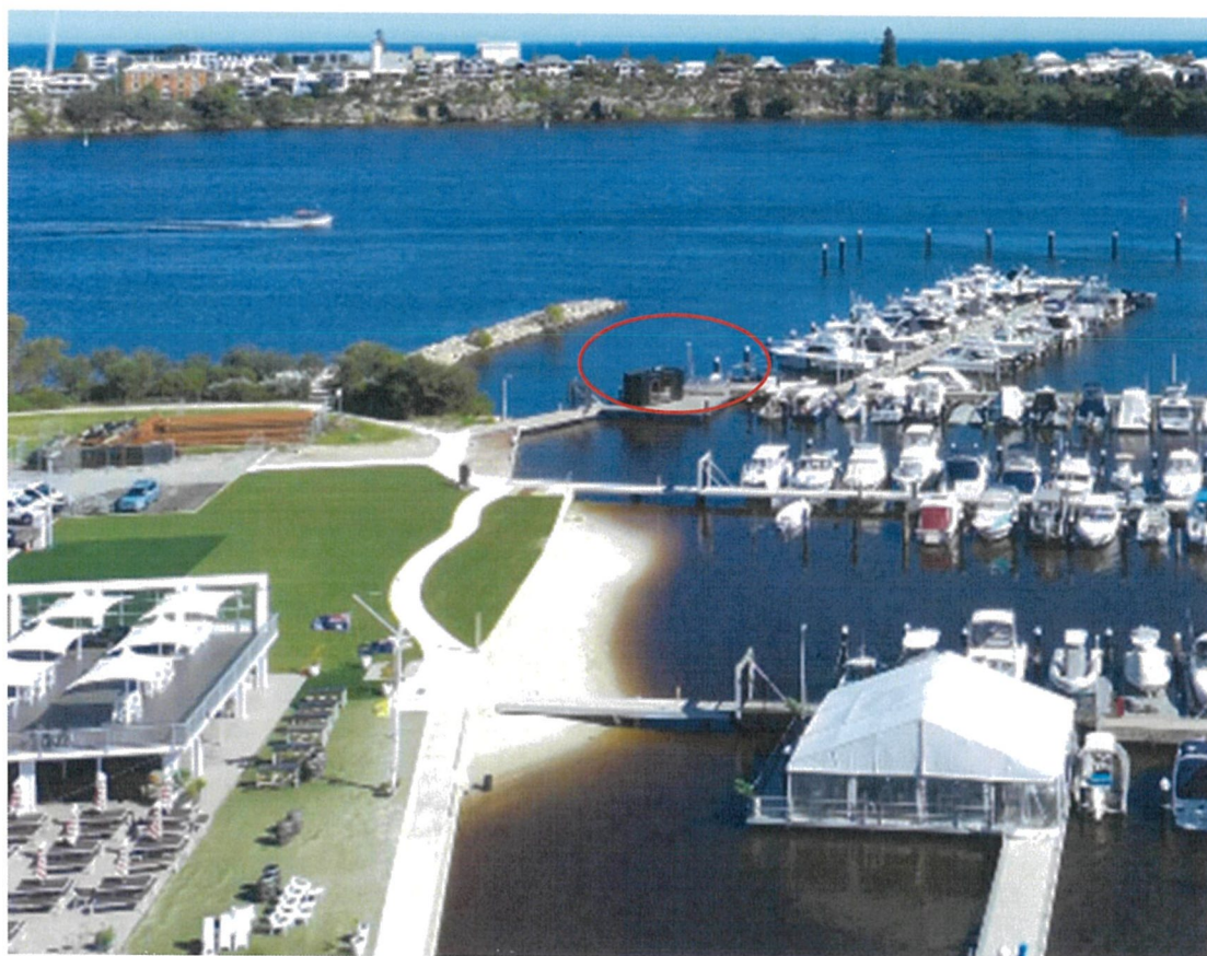
Figure 2: Sauna (circled in red) within the Club's River reserve lease