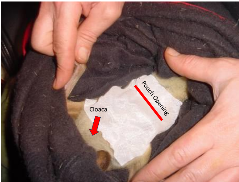
Figure 1: A woylie joey taped into its mother's pouch. The arrow (red) indicates the location of the cloaca, and the line shows the orientation of the pouch opening.