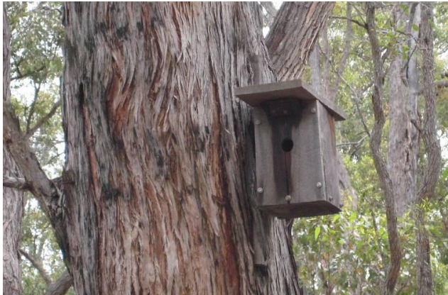
Figure 1 Nest box attached to jarrah tree.

This Standard Operating Procedure (SOP) provides advice on the use of nest boxes for monitoring arboreal mammals.