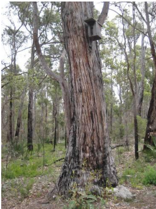
Figure 3 Nest box installed in a jarrah tree.