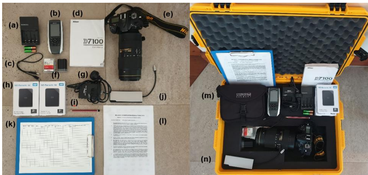
Figure 1 Equipment required for vessel-based cetacean surveys: (a) rechargeable batteries and charger, (b) handheld GPS (WGS84), (c) GPS cord, (d) DSLR camera manual, (e) DSLR camera with a 400mm zoom lens, (f) DSLR camera batteries, (g) DSLR battery charger, (h) 2Tb external hard drives, (i) pencils, (j) SD card reader, (k) clipboard and datasheets, (l) printed and laminated copies of Scientific and AEC licences, (m) binoculars, (n) Pelican waterproof protective case.

All equipment (including spares) should be tested and in good working order prior to departure for a survey (Figure 1). A check list should be created including all equipment and cleaning materials required (including spares) for the duration of the survey (Table 1). After returning from the day's survey, all equipment should be wiped down to remove salt spray, data should be downloaded and batteries placed on charge. It is useful to have a charging and data download area for this purpose.