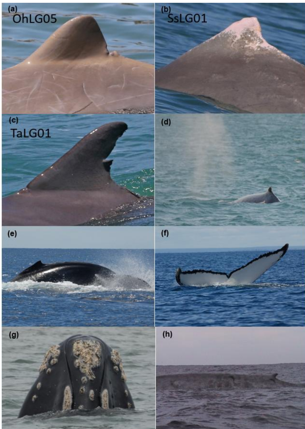
Figure 2 Photographs taken during vessel-based cetacean surveys used in identifying species and individuals based on unique patterns of nicks, scarring and pigmentation: (a) Australian snubfin dolphin ( Orcaella heinsohni ) dorsal fin, (b) Australian humpback dolphin ( Sousa sahalensis ) dorsal fin, (c) Indo-