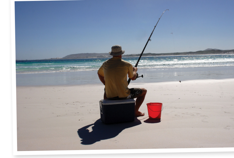
Above Fishing off Wharton Beach.

The marine environment of Western Australia's south coast is unique and includes outstanding natural values. The region supports diverse marine habitats, plants and animals, and is home to the Great Southern Reef – a system of temperate reefs dominated by kelp forests spanning more than 8000km from Kalbarri in Western Australia's Midwest, across Australia's southern coastline, and north as far as the subtropical waters of northern New South Wales. Australia's south-west marine environment is a global biodiversity hotspot, and the natural and cultural values found here provide a range of social and economic benefits, including generating employment and revenue for the region.