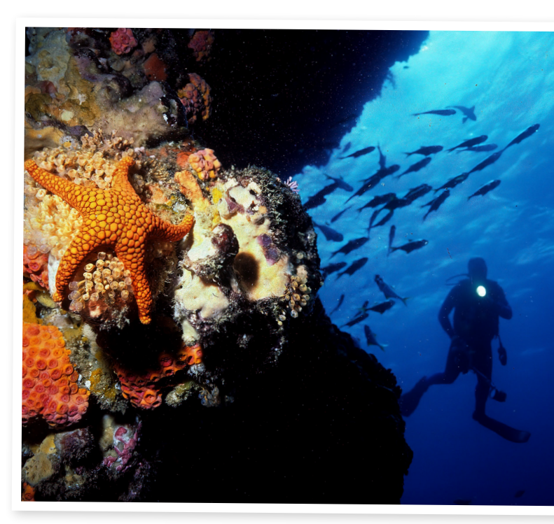
Above Diving.

Marine ecotourism activities, including dive charters and whale and dolphin watching, are increasingly popular and enable visitors to better appreciate and understand the region's natural values.