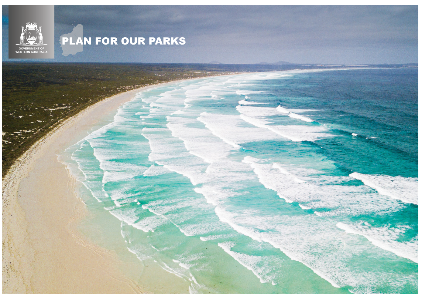
Part of the spectacular south coastline.