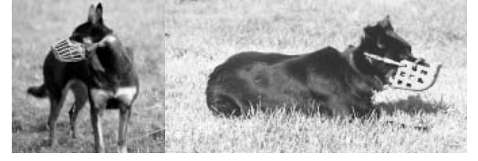
A well fitted muzzle is money well spent and widely used in some states.