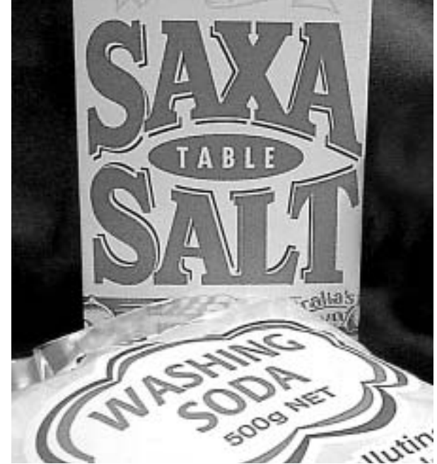
These household items may be used to induce vomiting in dogs and pets.