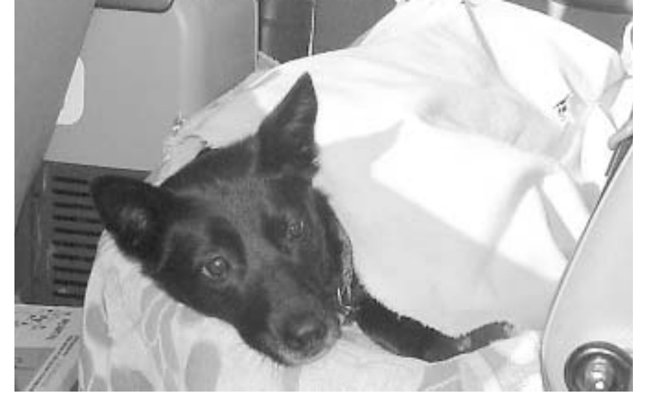
Keep your dog quiet and securely restrained during transport to prevent it hurting itself or others and to slow the rate of energy use.