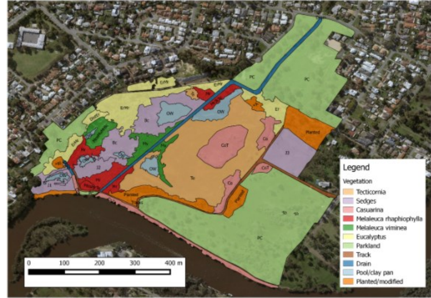
Figure 4: Current distribution of vegetation units.

stormwater from Woolcock Court Drain, before it discharges to the Swan River. High nutrient and metal concentrations within Chapman Street Drain and the Kitchener Street Drain discharge directly into the Swan River.