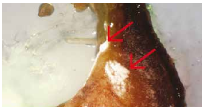
Figure 3 Quambalaria pitereka sporulating on internal flower bud tissues – from the carpel and disc (arrows) after 3 days incubation on half strength potato dextrose agar (Bar = 2 mm).