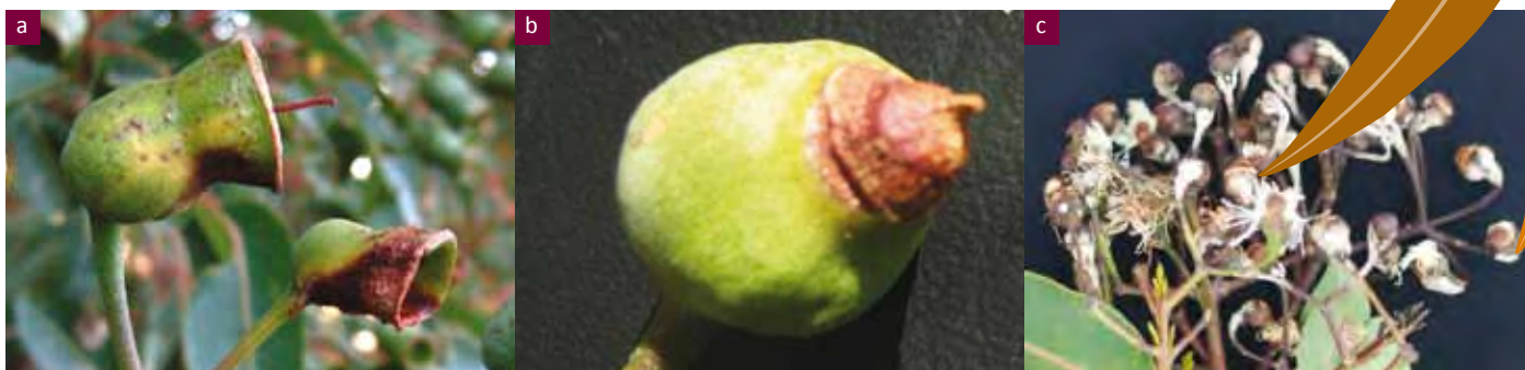
Figure 2 Quambalaria infection of flower buds can lead to deformities such as 'horizontal' growth of fruit (a) and unsuccessful operculum opening (b), or complete termination of the flowers (c).

Infection of the developing fruit may arise opportunistically due to wounding or infection of the ovaries. Infected fruit grow in a deformed 'horizontal' pattern (Figures 2b, 4b), caused by infection of one or more carpels at early stages in the flower's development. The horizontal growth habit results in significantly smaller fruit and seeds and a severe reduction in the number of seeds produced per fruit. Most 'horizontal' fruit contains no seeds.