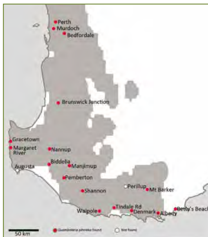
Figure 1 Quambalaria pitereka was found across southwest WA during surveys conducted from April 2009 to May 2010. Only two of 17 sites surveyed did not test positive for Q. pitereka .

Quambalaria pitereka was isolated from the carpels, and occasionally also from the 'disc' (or 'ovary roof') above the affected carpel (Fig.3). On one occasion Q. pitereka was isolated from the pollen of an infected flower bud, which presents significant risk for transmission of the disease by pollinators.