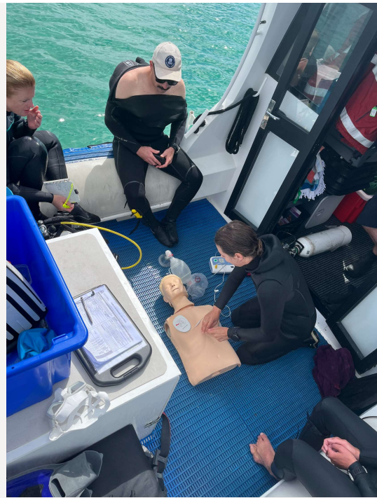
Image right: Marine team onboard Department of Transport vessel PV2 practicing dive rescue scenarios.